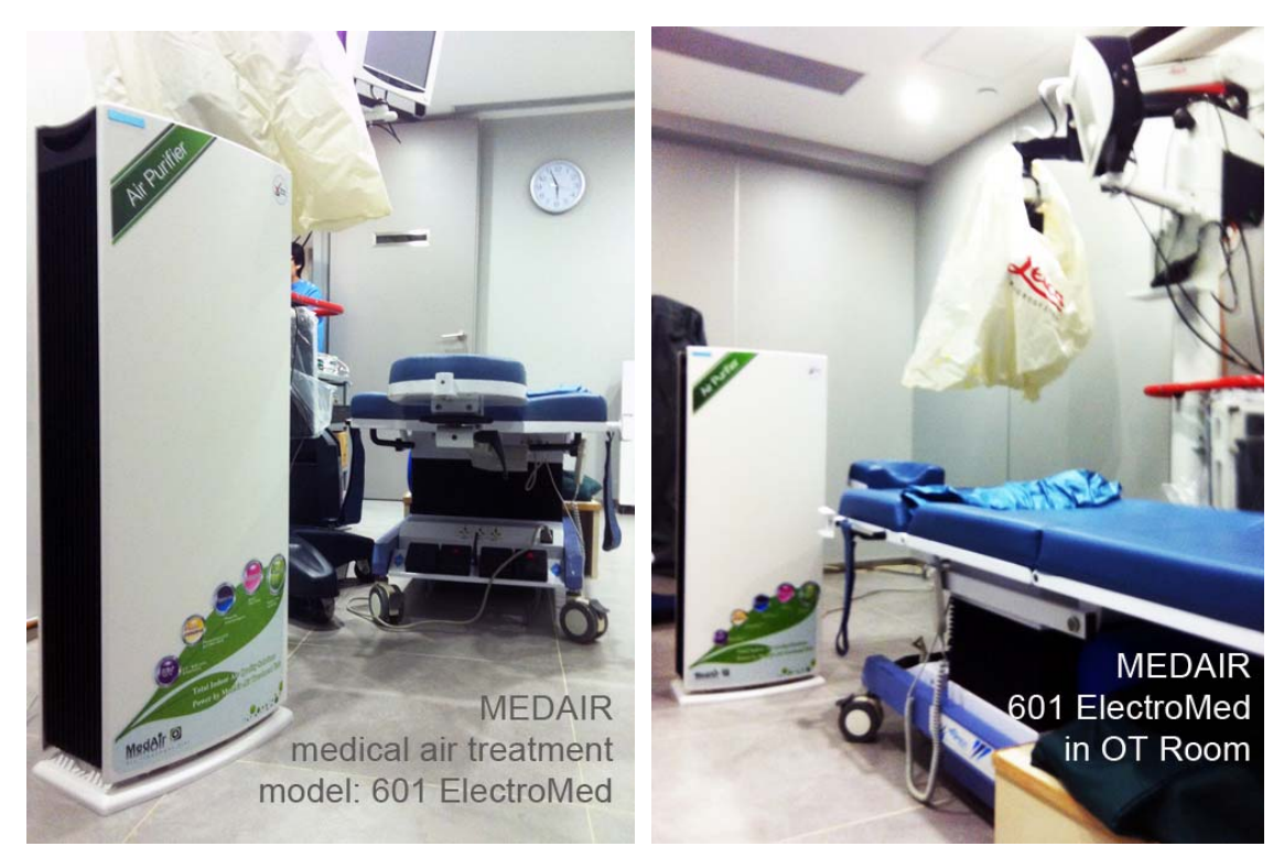
OT Room apply MEDAIR 601 ElectroMed for air sanitizing purpose during the daily clean and sanitizing schedule.